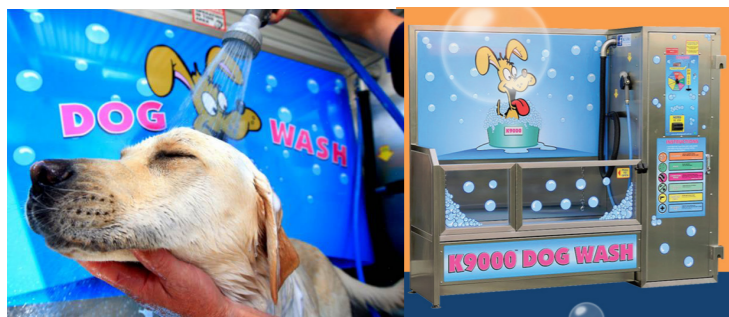
An example of a Self Serve Dog Wash Station

Quality Hydro Bath Equipment Cleaner with dual quaternary commercial grade disinfectant, that cuts through dirt and germs, leaving it disinfected and fresh with our Australian botanicals natural spearmint fragrance. #21269