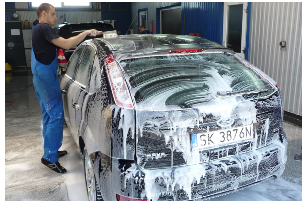
Prime Mover can be used with a hand held sponge or brush, or through a commercial foamer.