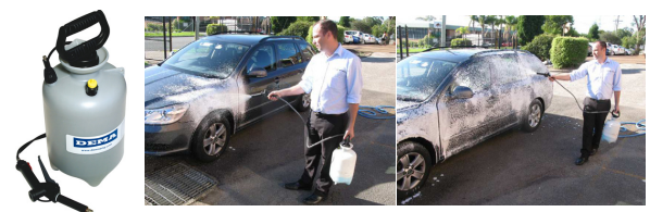
Using the Dema 9002PU Foamer