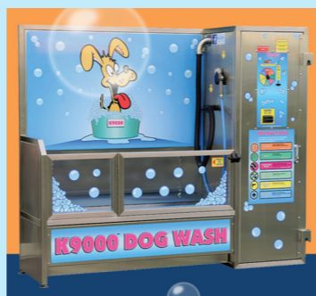
An example of a Self Serve Dog Wash Station