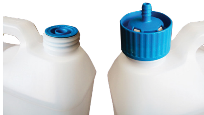
Safe Link Valve - stops excess product use, spills and colour coding for ease of use

Easy grip handle to pull and prime chemical reservoir