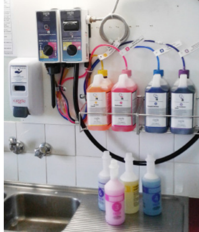
Promax System filling station