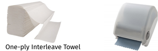
One-ply Interleave Towel

'Auto Cut' dispenser with auto-cutting mechanism.