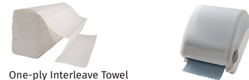
One-ply Interleave Towel

'Auto Cut' dispenser with auto-cutting mechanism.