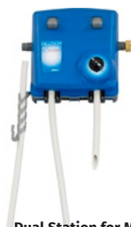
Dual Station for Multiple Products or Dilutions