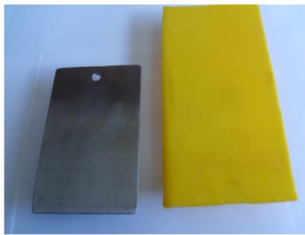
After LAB 450 clean