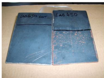
New (left) vs. old formulation, cleaned in Lab 450, rinsed and left to air dry and age for 4 weeks.