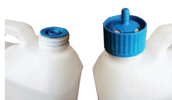
Safe Link Valve - stops excess product use, spills and colour coding for ease of use