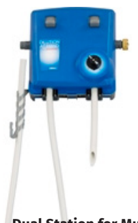
Dual Station for Multiple Products or Dilutions