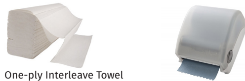
One-ply Interleave Towel