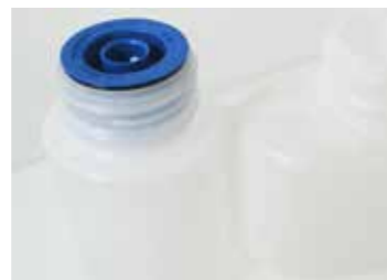
Safe Link Valve - stops excess product use, spills and colour coding for ease of use