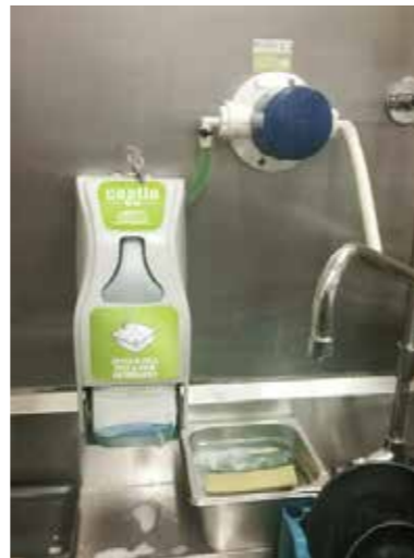
Mulit Dose Locking Cabinet System