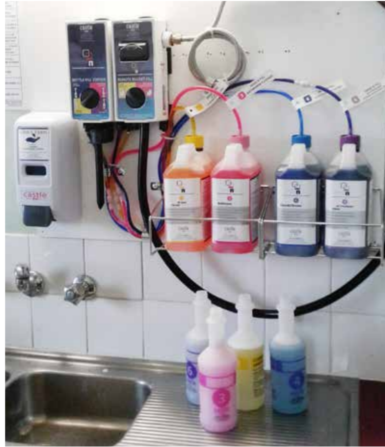
Promax System filling station