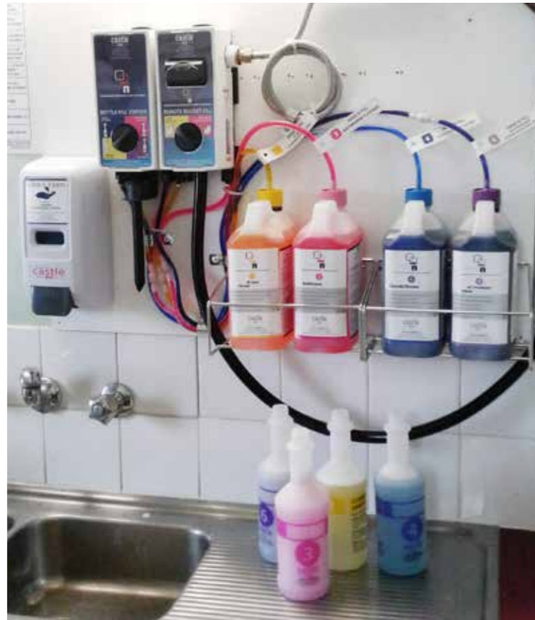
Promax System filling station