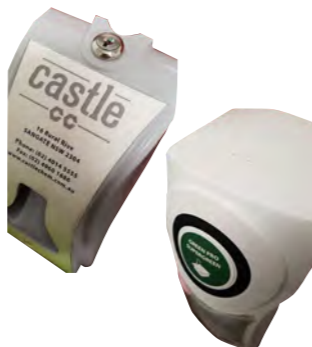
Both units lock for safety