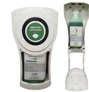
Eco Shot locking cabinet