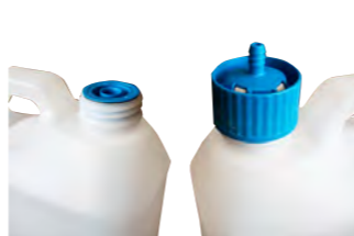
Safe link valve