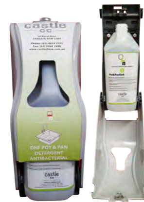
Mulit Dose locking cabinet