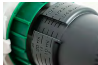
Dosing ring with dosing marks