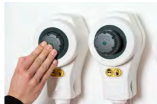
Twist and Push operation