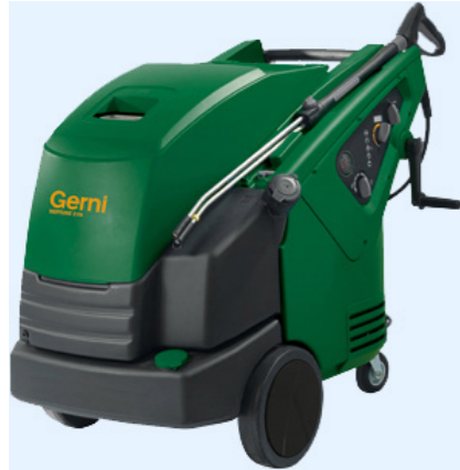
Gerni Neptune 5 FA