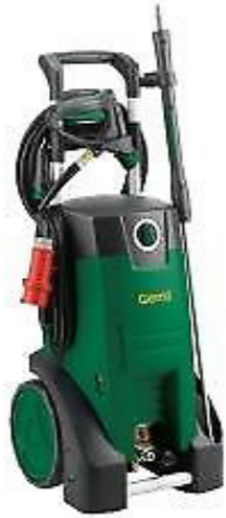
Gerni Poseidon 4