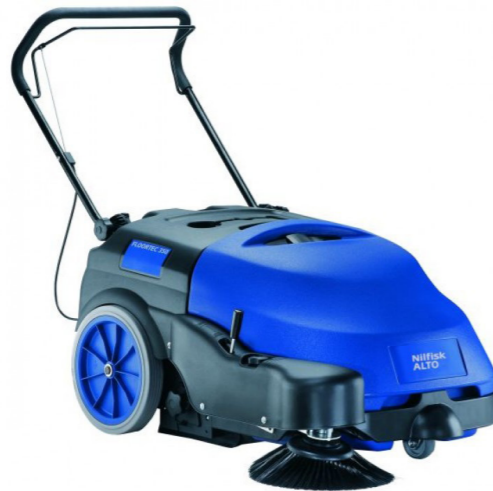
Alto Floortec 350