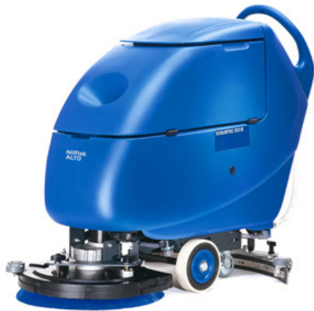
Alto Scrubtec 553