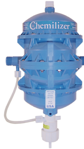
Hydro Chemilizer ch9000