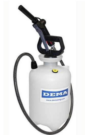
Demo 900wc Foamer