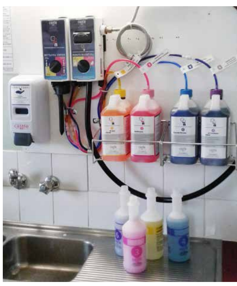
Promax System filling station