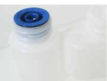
Safe Link Valve - stops excess product use, spills Cabinet System and colour coding for ease of use