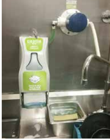
Mulit Dose Locking